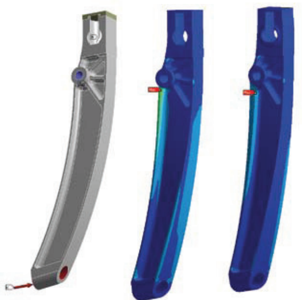
Pedal failure corresponding to the ANSYS stress plot, showing how the model was restrained and loaded: loads and constraints (left), original design (middle) and optimized design (right)